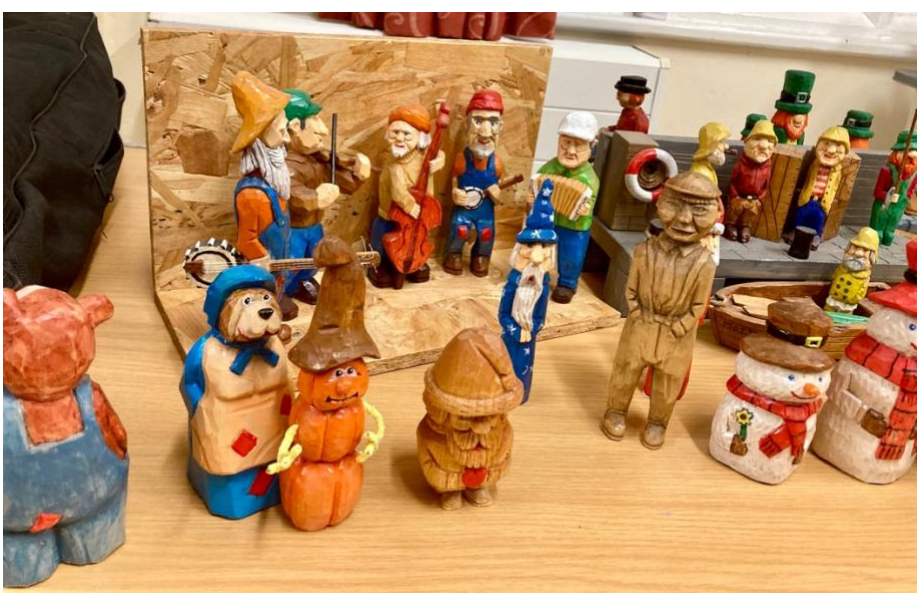
UK Whittlers Facebook. Is a Facebook group for whittlers which holds a 1-hour session on a Wednesday evening.